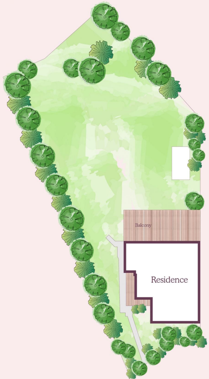
Siteplan (Not To Scale)