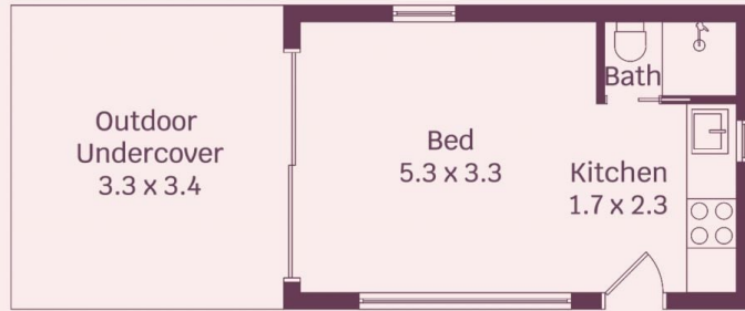
Studio Not In Position